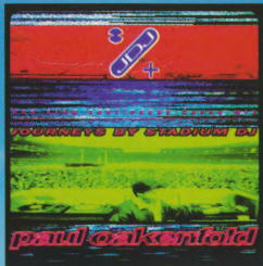
JDJ- PAUL OAKENFOLD MM 80008